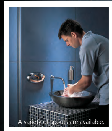
A variety of spouts are available.

Rada Sense digital mixing valve - shower sensor Part number: 1503684