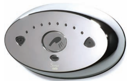
Rada Sense Control Panel (Shower sensor shown)