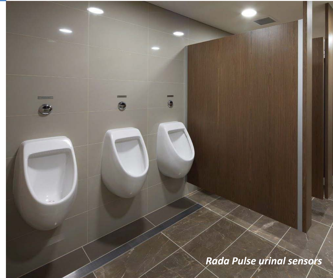
Rada Pulse urinal sensors