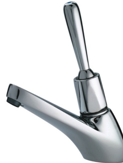
Presto 705 (certified as compliant with AS1428 for accessible bathrooms)