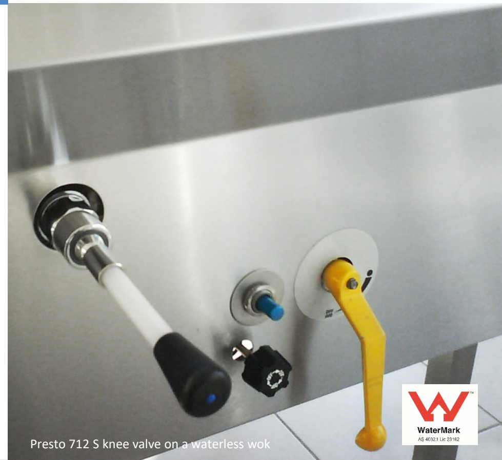
Presto 712 S knee valve on a waterless wok