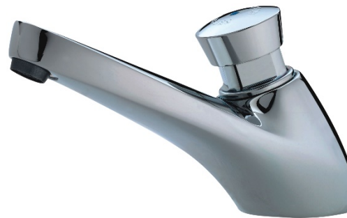
Presto 605 Timed flow tap