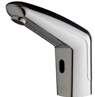
Presto Volta Sensor tap

* Ask for our AS 1428.1 – 2009 brochure which lists which basins they are compliant with