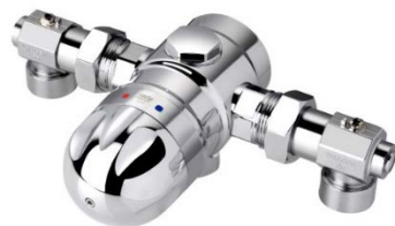
Rada 320 IF

Min flow rate (at mid-blend with equal dynamic supply pressures)