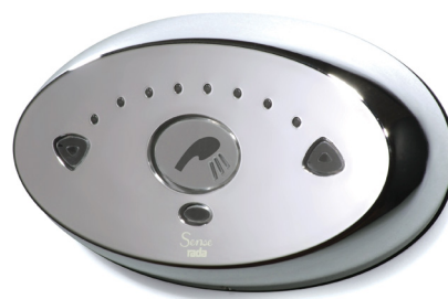
Rada Sense Control Panel (Shower sensor shown)